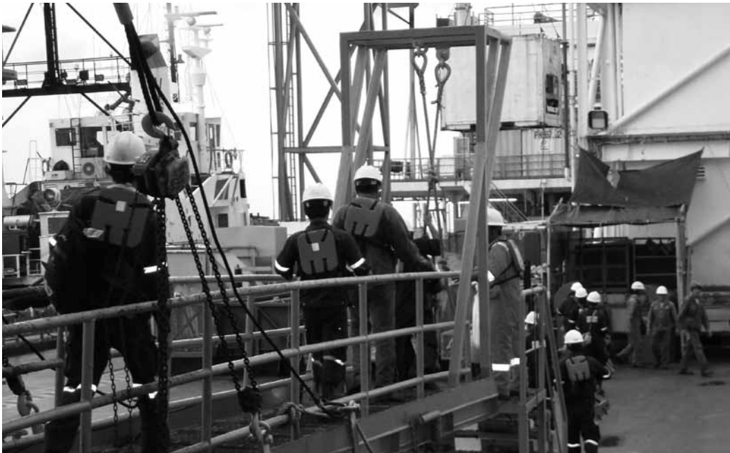
National workers depart for production fields, offshore Thailand. Drakken has comprehensive experience in the safe and effective management of national workers using expatriate supervision both on and offshore.

In addition to our site based hazard analysis and permit to work program, we ensure our employees are certified in the following as required by occupation: Arc Flash Training, Confined Space, Ground Disturbance, Fall Protection, H2S Gas Survival, and First Aid.