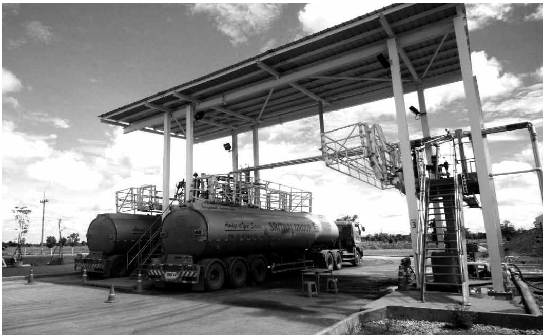
Truck offloading facility completed in Thailand. Drakken's experience related to both crude and gas handling and metering applications around the world is extensive.